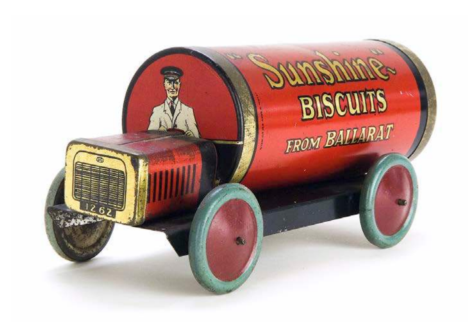
Image: Leckie and Gray Sunshine Biscuits from Ballarat truck 1930s, tinplate; lithography. The Luke Jones Collection.