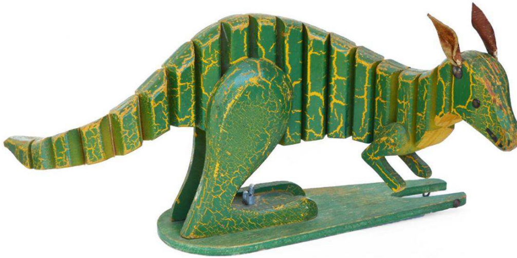
Image: Winkie Toys Kangaroo , early 1930s, wood, paint, leather. The Luke Jones Collection.