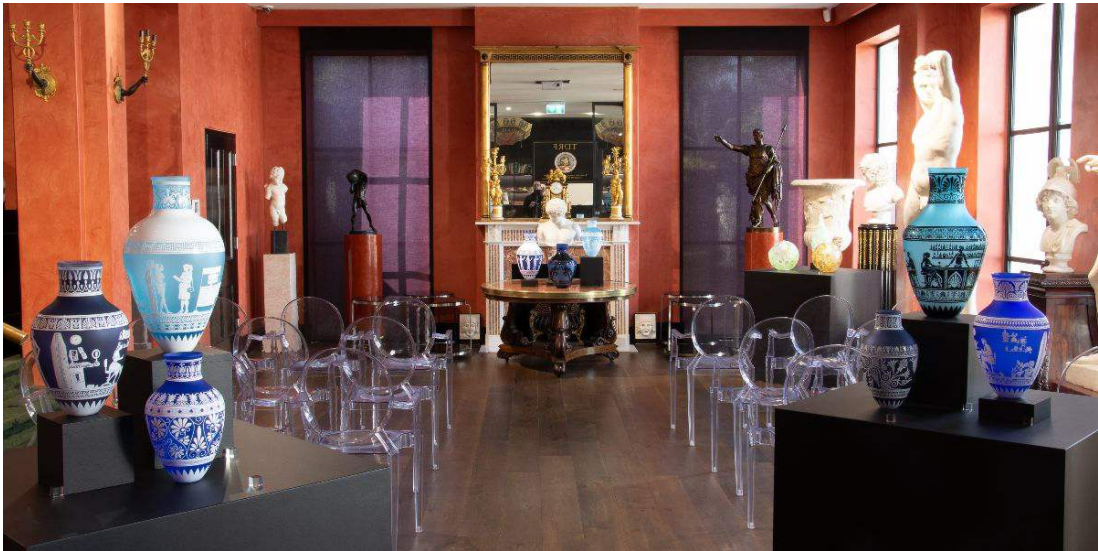
Image: Luminous glass forms depicting pithy narratives of our current era are yours to see for free throughout August!