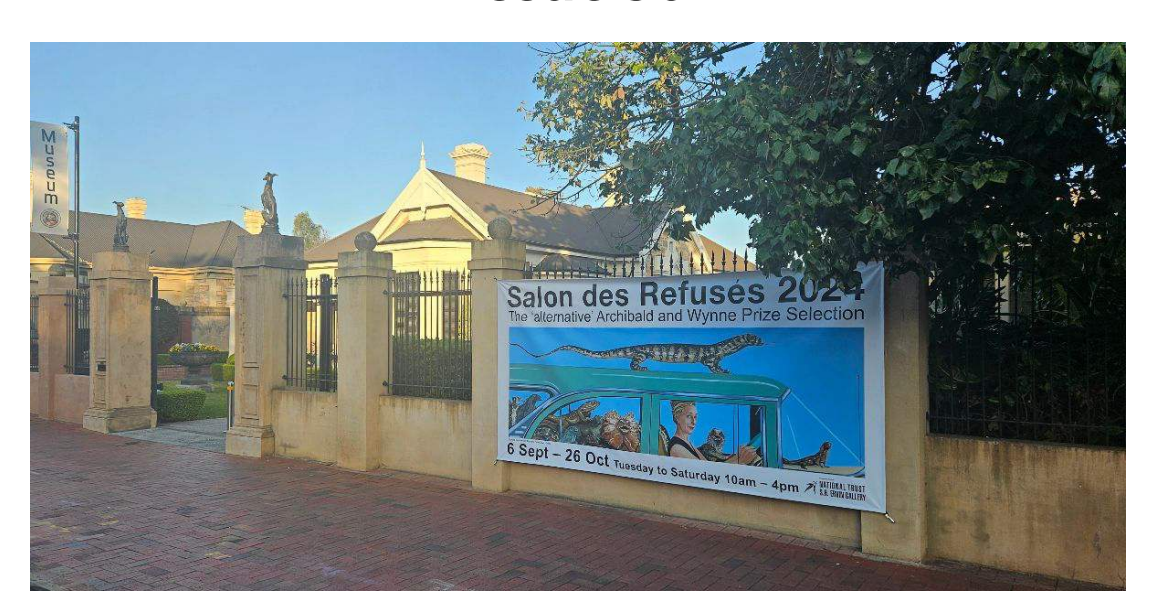
Image: We look forward to welcoming you back to the museum to see Salon des Refusés 2024 from Friday!